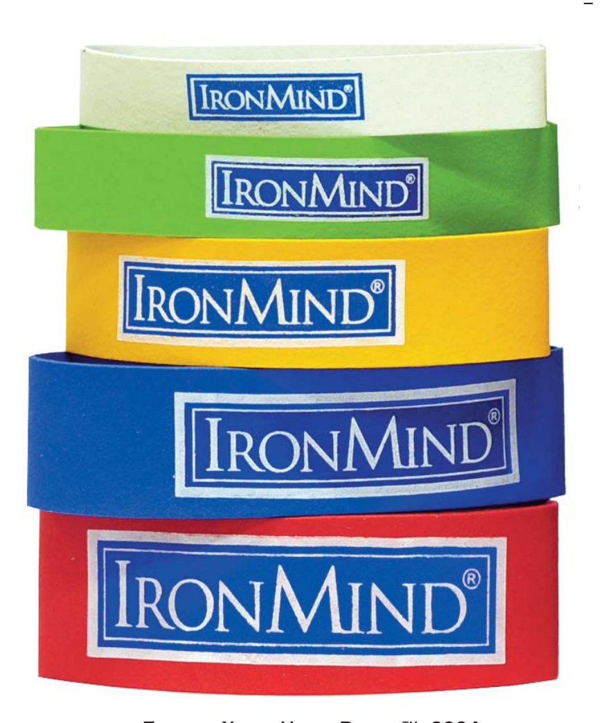
EXPAND-YOUR-HAND BANDS™, 2004