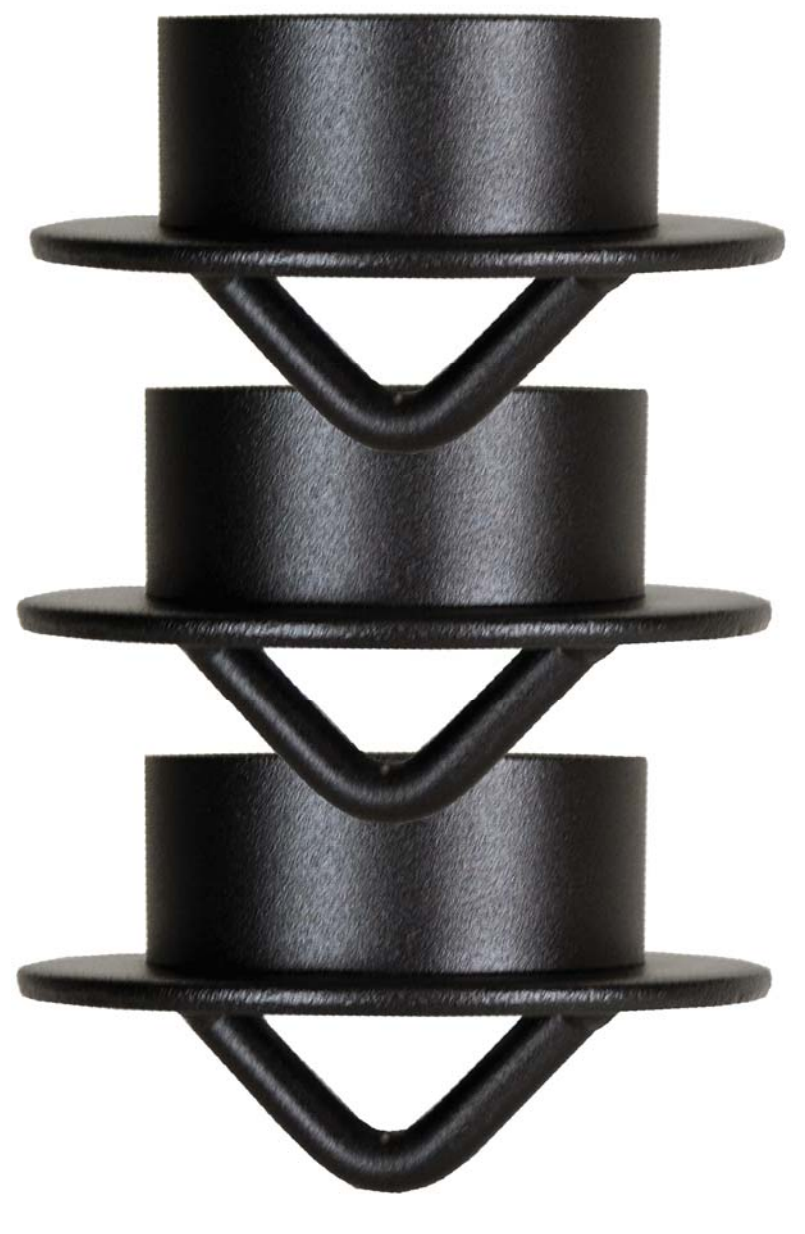
IRONMIND HUB, 1991