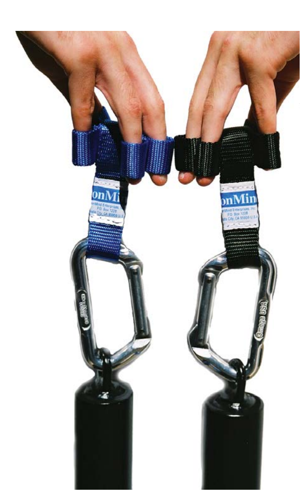
OUTER LIMITS LOOPS, 2001