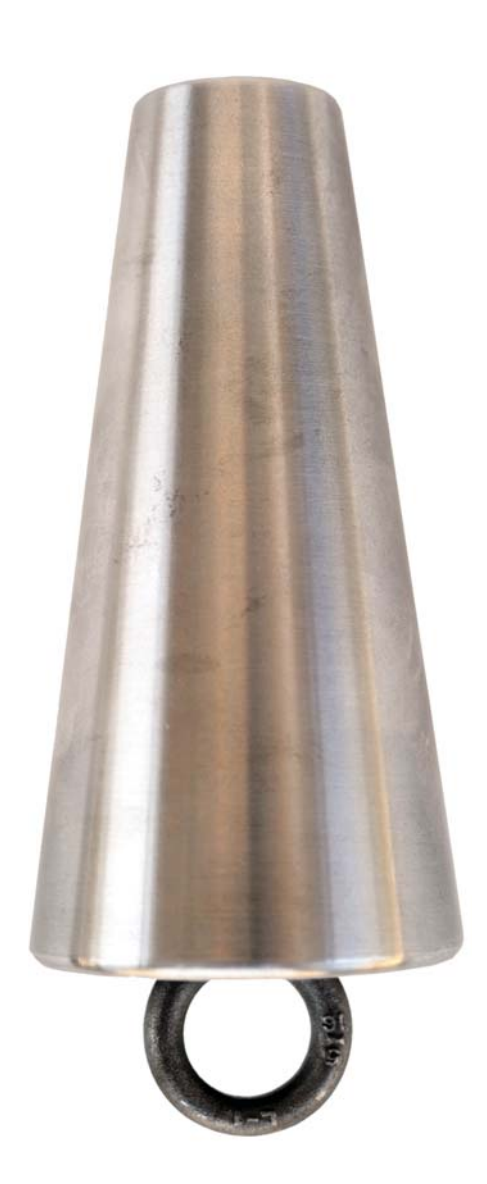
LITTLE BIG HORN, 2002