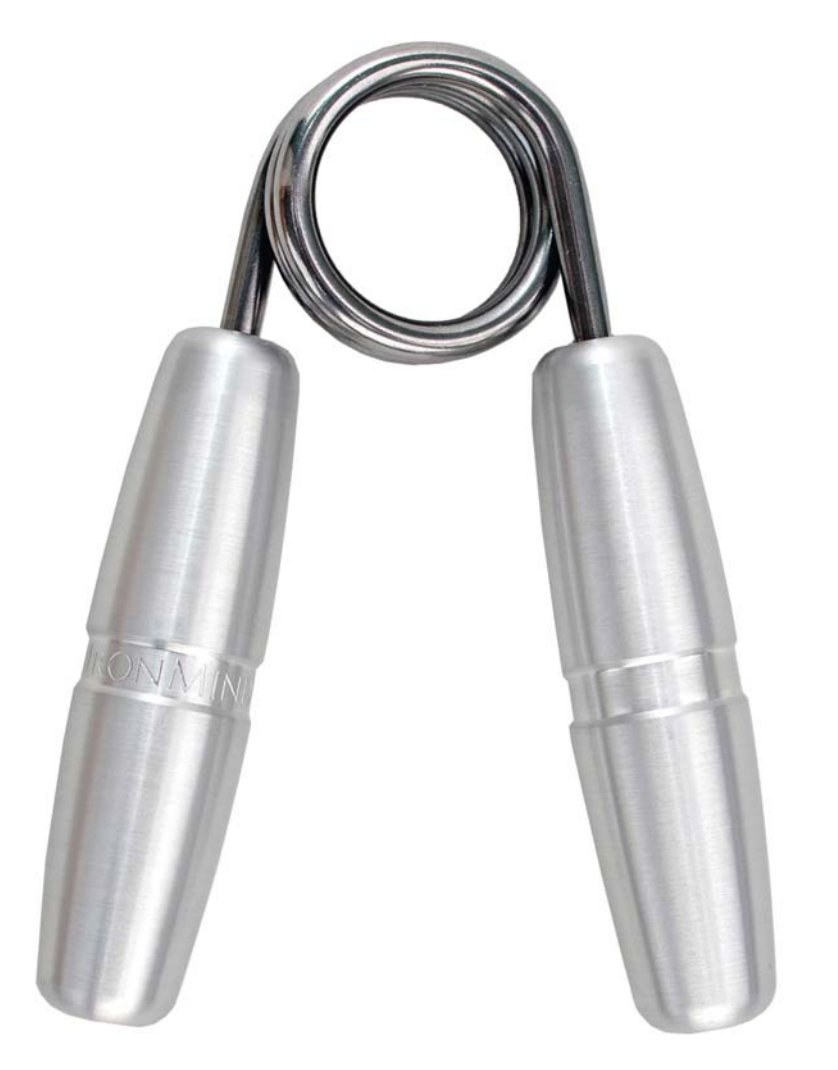
ZENITH GRIPPER, 2013 ALUMINUM, STEEL. 6 STRENGTHS. DESIGNED AND MADE IN THE USA.