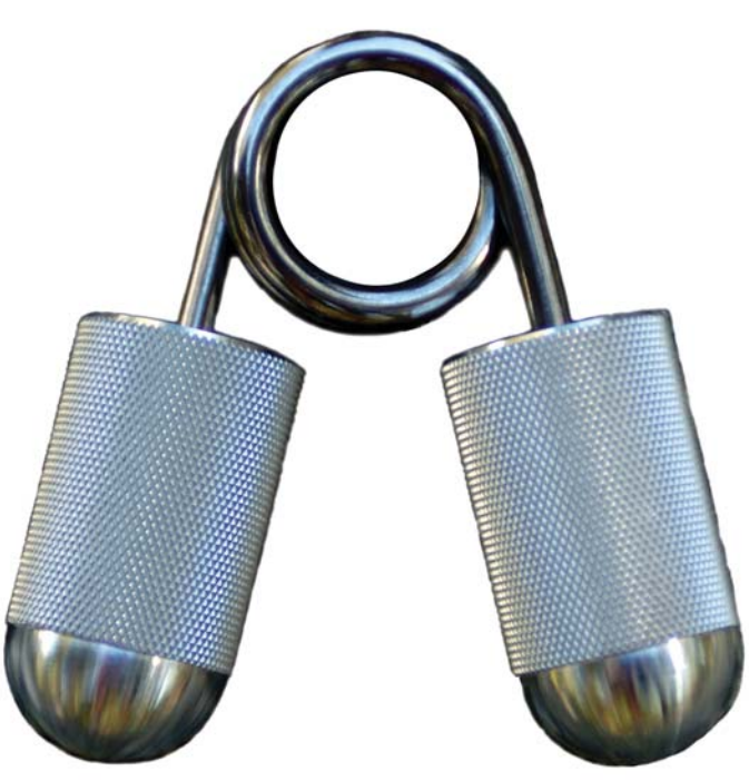
IMTUG™: Two-Finger Gripper, 2005

ALUMINUM, STEEL. 7 STRENGTHS. DESIGNED AND MADE IN THE USA.