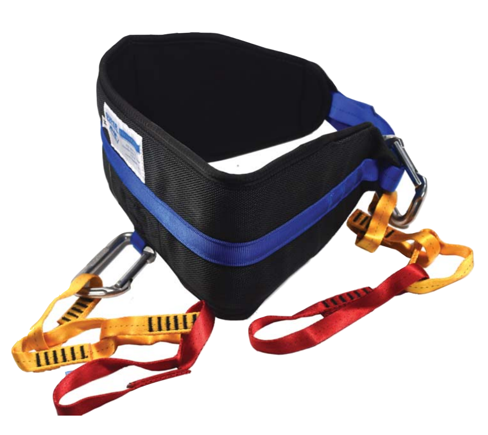
SUPER SQUATS® HIP BELT, 1990

NYLON, FOAM, POLYESTER, ALUMINUM. DESIGNED AND MADE IN THE USA.