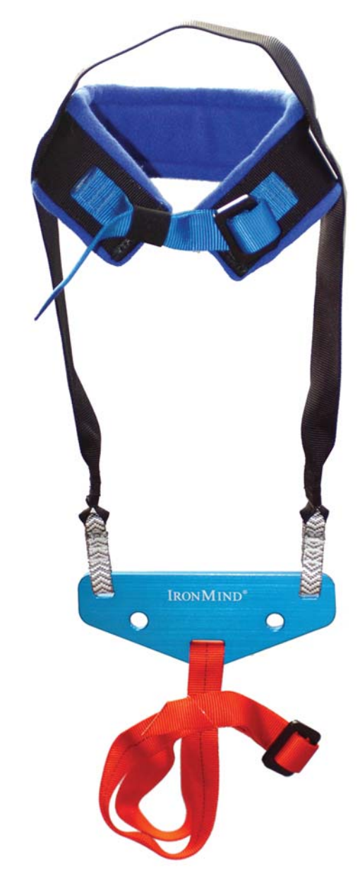
HEADSTRAP FIT FOR HERCULES™, 1991