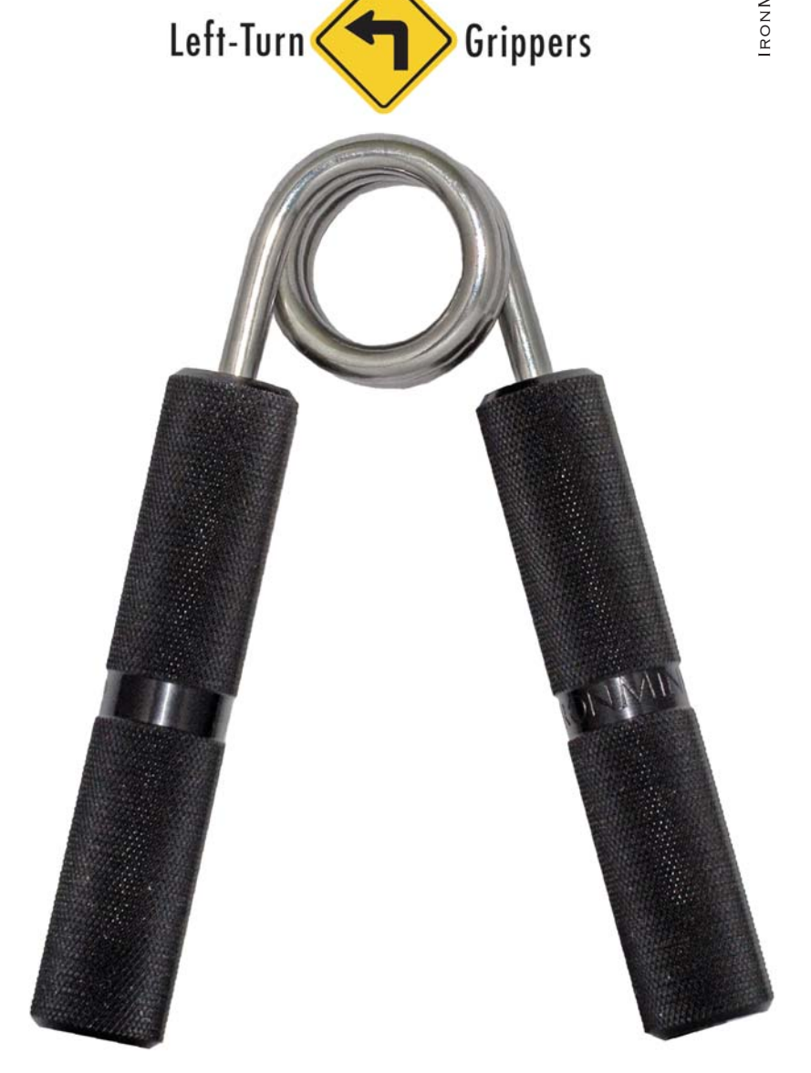
LEFT-TURN GRIPPER, 2015 ALUMINUM, STEEL. 4 STRENGTHS. DESIGNED AND MADE IN THE USA.