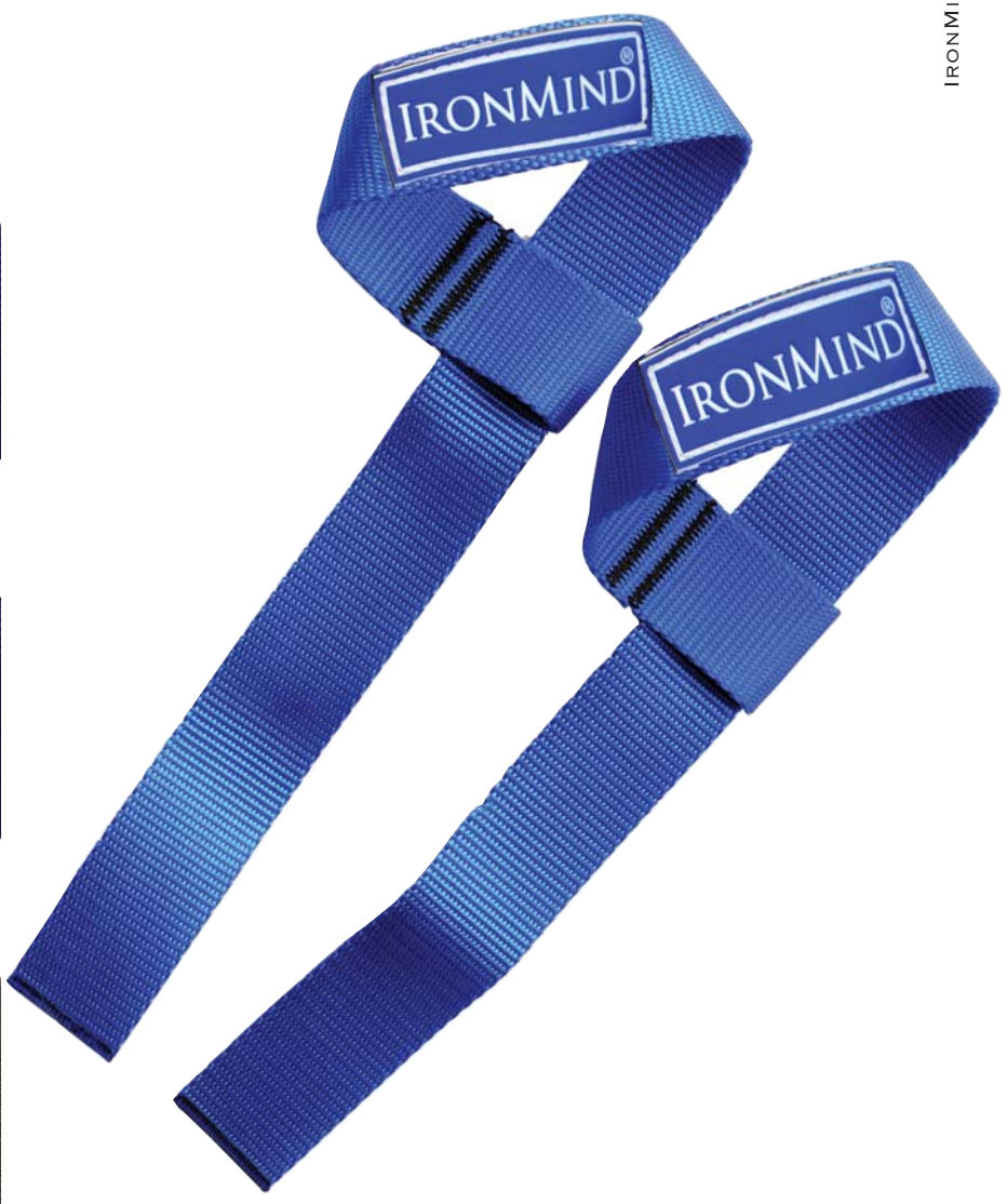
STRONG-ENOUGH LIFTING STRAPS, 2000 NYLON. DESIGNED AND MADE IN THE USA.