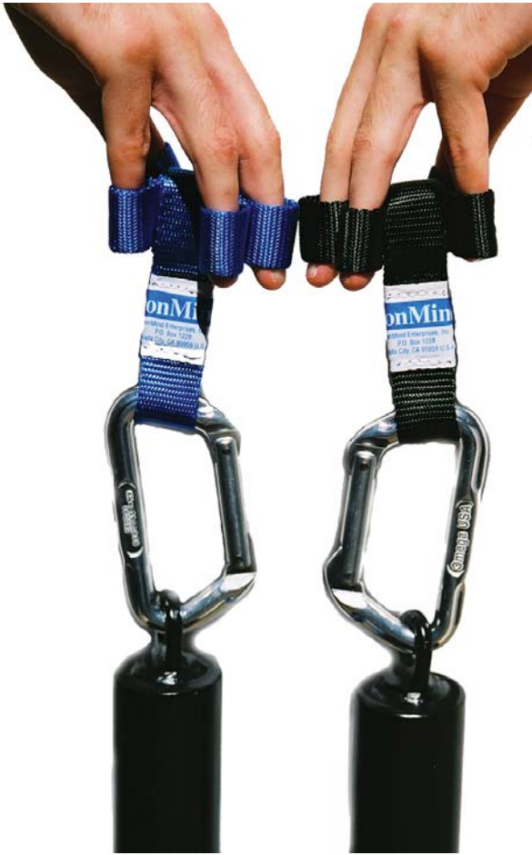
OUTER LIMITS LOOPS, 2001 NYLON. DESIGNED AND MADE IN THE USA.