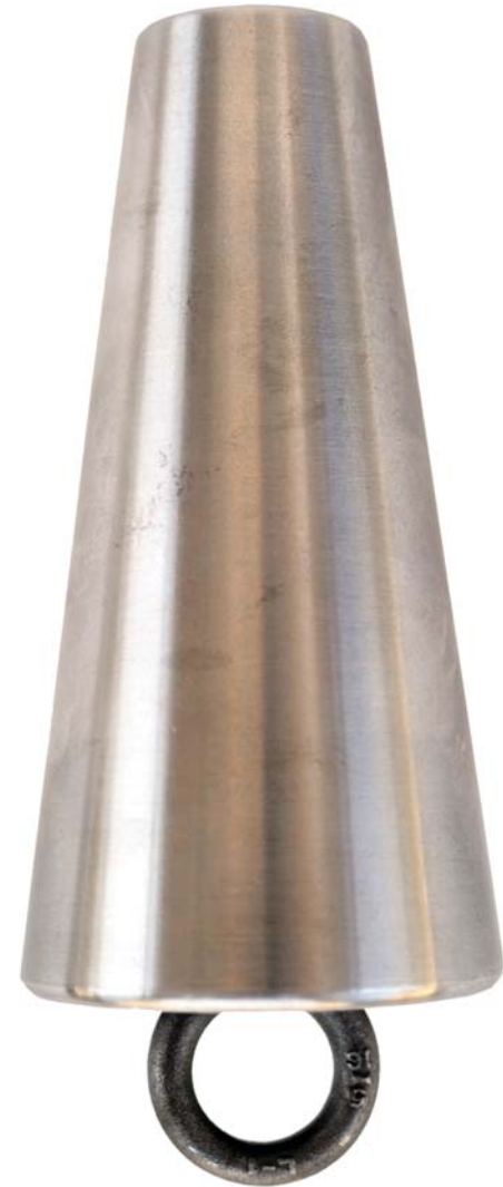
LITTLE BIG HORN, 2002