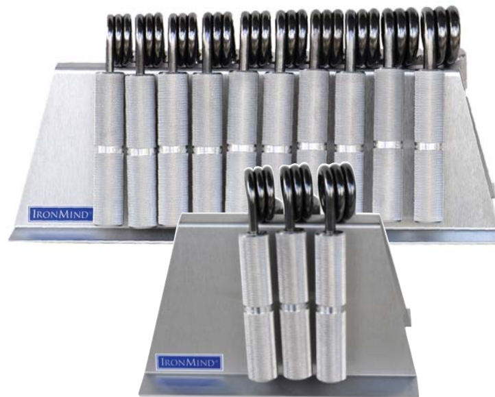
LARGE AND SMALL V-CADDIES, 2009 ALUMINUM. DESIGNED AND MADE IN THE USA.