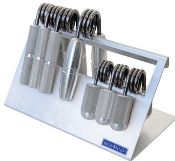
COMBO CADDY, 2013 ALUMINUM. DESIGNED AND MADE IN THE USA.