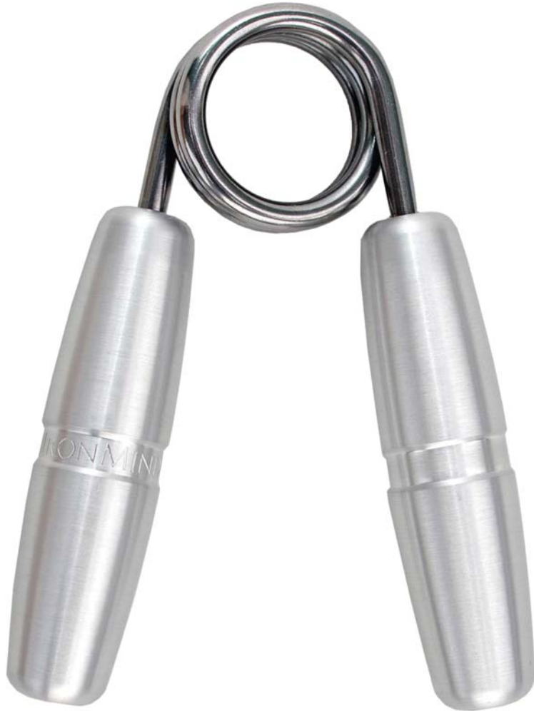
ZENITH GRIPPER, 2013 ALUMINUM, STEEL. 6 STRENGTHS. DESIGNED AND MADE IN THE USA.