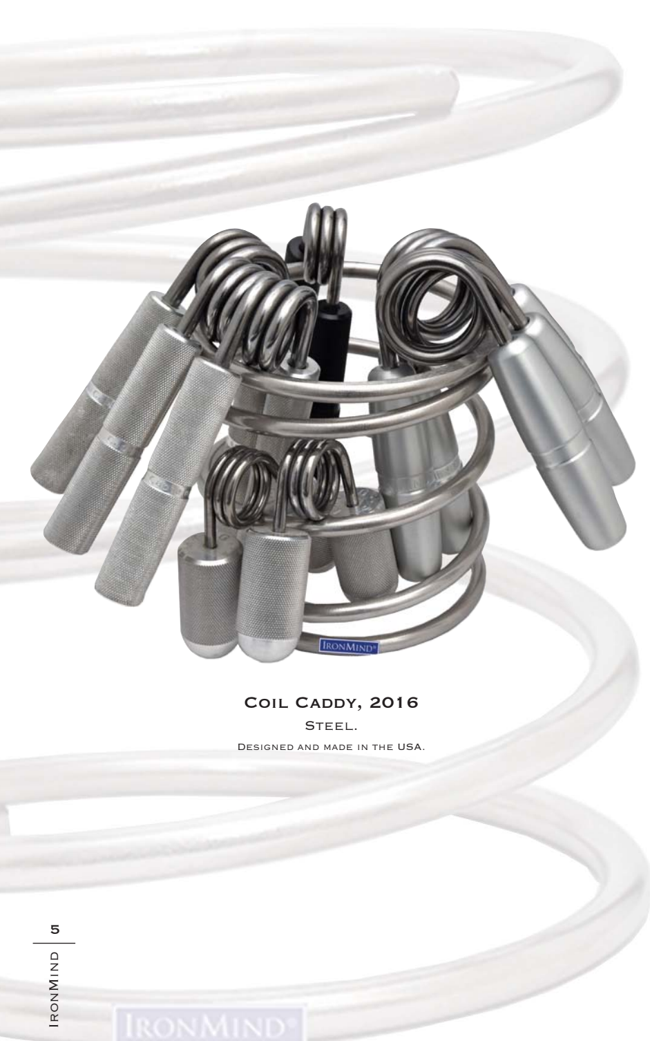
COIL CADDY, 2016 STEEL. DESIGNED AND MADE IN THE USA.