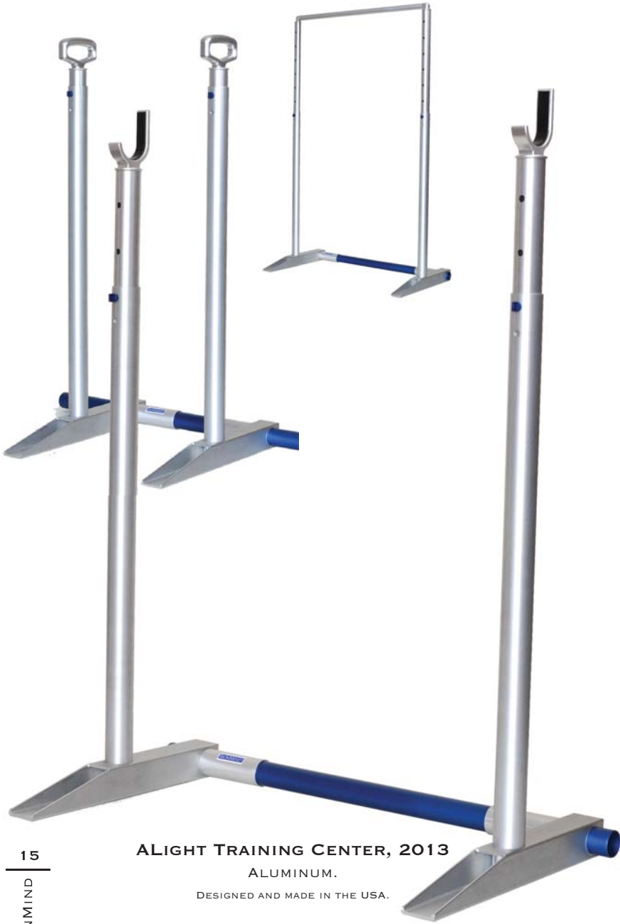
ALIGHT TRAINING CENTER, 2013