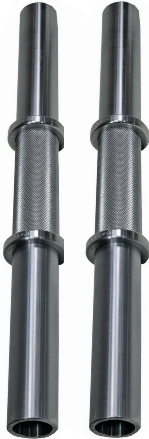
OLYMPIC HUSKY HANDLE DUMB- BELL BARS, 1992 STEEL. DESIGNED AND MADE IN THE USA.