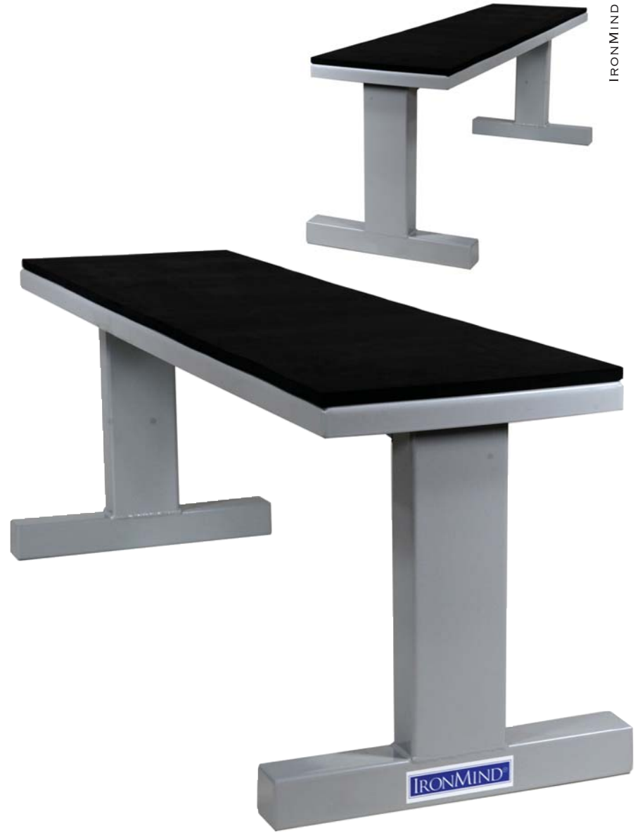
FIVE STAR FLAT BENCH, 1993