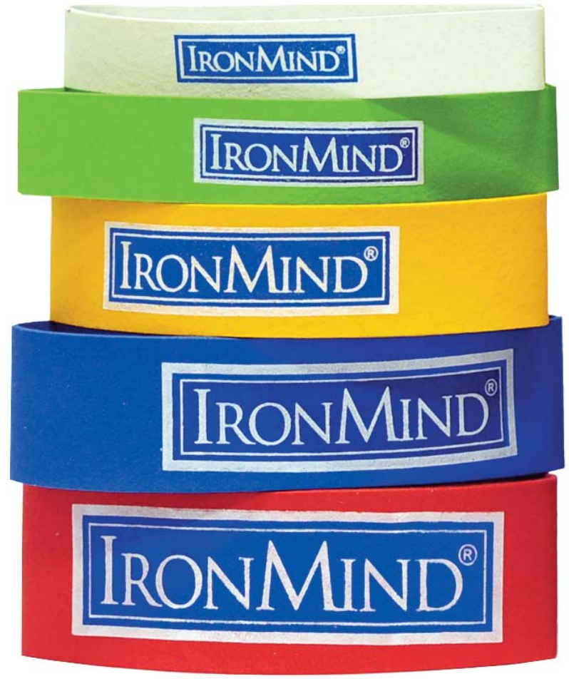
EXPAND-YOUR-HAND BANDS™, 2004 RUBBER. DESIGNED AND MADE IN THE USA.