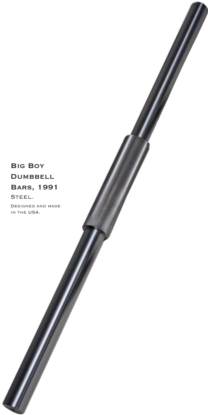
BIG BOY DUMBBELL BARS, 1991 STEEL. DESIGNED AND MADE IN THE USA.