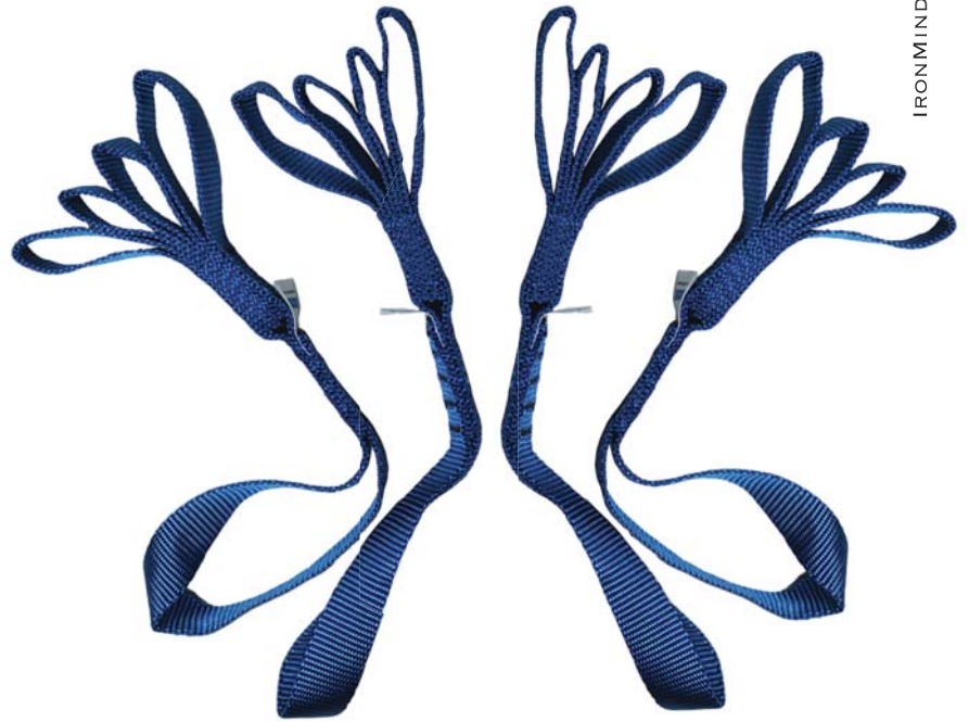
EAGLE LOOPS, 1993 NYLON. DESIGNED AND MADE IN THE USA.