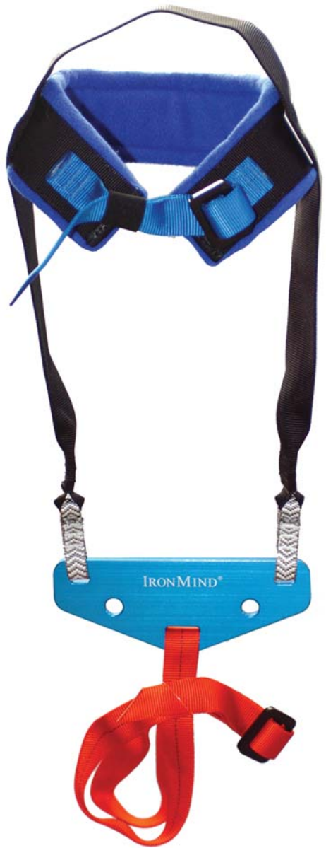
HEADSTRAP FIT FOR HERCULES™, 1991 NYLON, FLEECE, ALUMINUM. DESIGNED AND MADE IN THE USA.