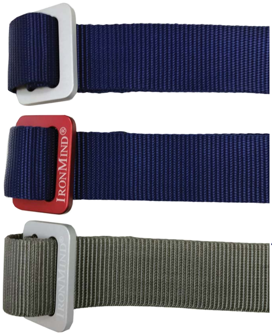
Z1500 BELT, 2005 NYLON, ALUMINUM. DESIGNED AND MADE IN THE USA.