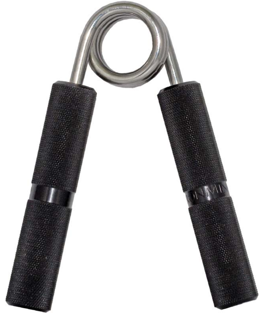
LEFT-TURN GRIPPER, 2015 ALUMINUM, STEEL. 4 STRENGTHS. DESIGNED AND MADE IN THE USA.