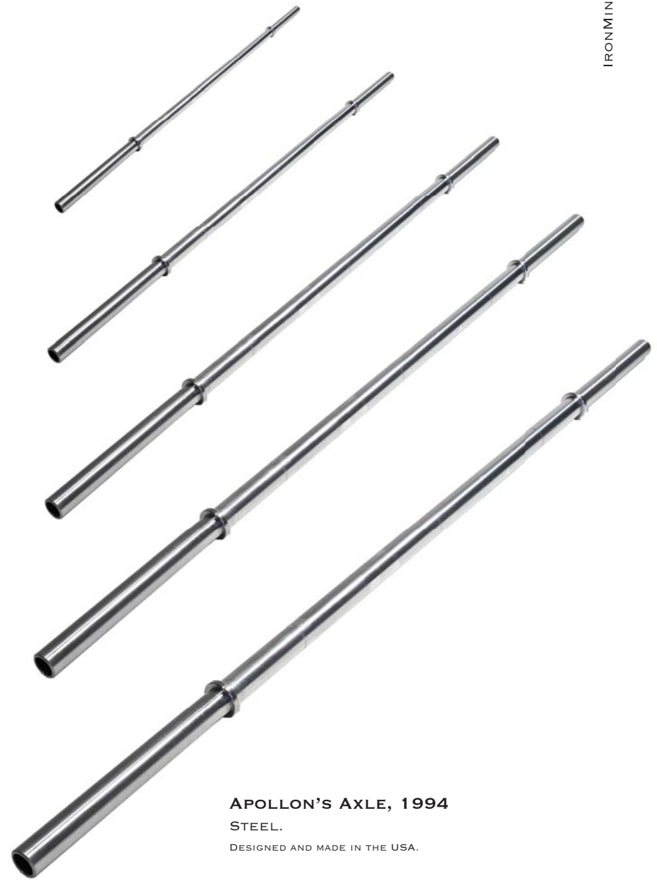
APOLLON'S AXLE, 1994 STEEL. DESIGNED AND MADE IN THE USA.