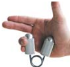
Upside down, training the ring finger and pinky